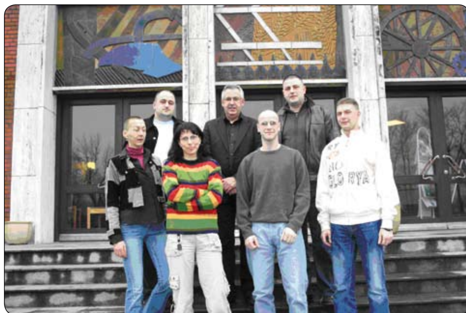
Serbian trainees with Danish Minister of Food and Agriculture, Hans Chr. Schmidt in front of Bygholm Agricultural Academy.