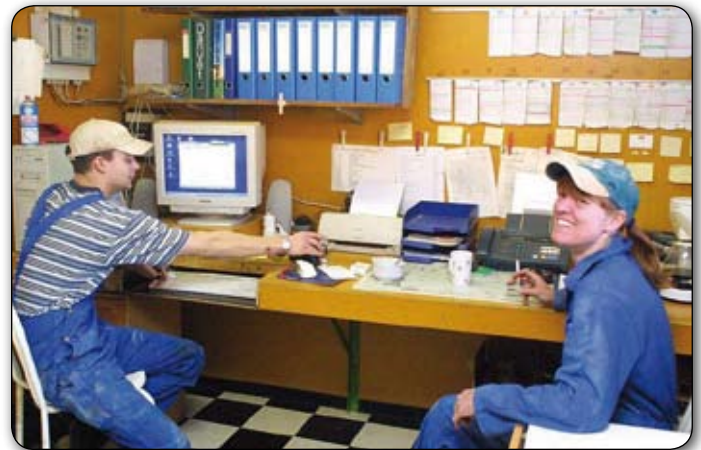
Systematic working routines and regular recording of production data are key components in any pig farm management programme.

Training in modern management methods and pig caretaking is the objective of a comprehensive set of new tailor-made courses for pig caretakers around the world, which are organized by Danish Farm Design A/S – a company that specializes in development and design of large pig units, training of pig farm managers and management support internationally.